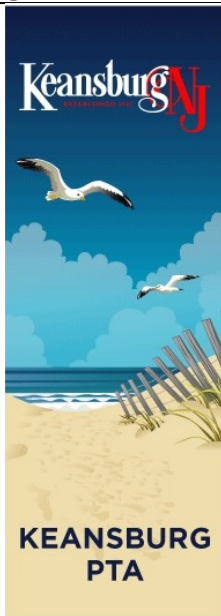
Seagull Banner Sample

Please check off your Banner Design below: